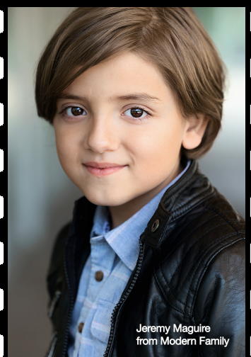
Jeremy Maguire from Modern Family